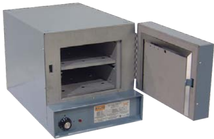
Compact In-Shop Models...