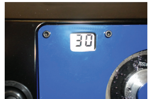
Digital angle readout