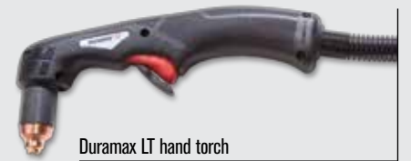
Duramax LT hand torch