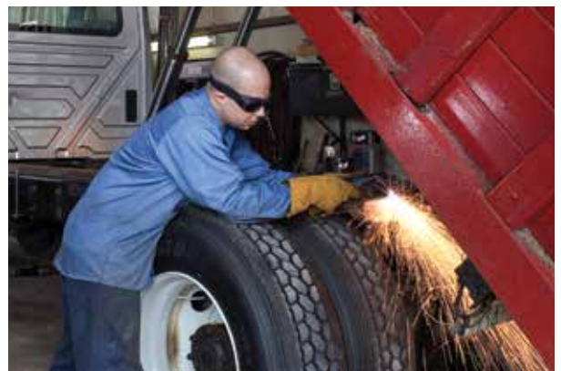
Vehicle repair and modification